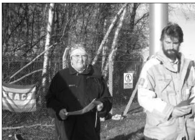
Advent Vigil at Aldermaston, 26 November 2009 More vigils on 10 & 17 December, 1 - 2pm

In this issue: Campaigning in 2010 Christian CND 50th Anniversary NPT Christian Witness to Peace Plus news, events and prayer diary