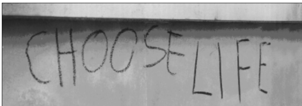
The Ministry of Defence, marked with blessed charcoal, Ash Wednesday 2004

Christi, St Joseph's, Watford Way, Hendon NW4 4TY 020 8203 4884; www.paxchristi.org.uk