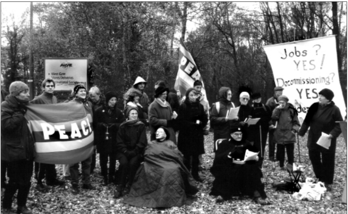
A remarkable crowd turned up for the first Advent Vigil of 2006 at AWE Aldermaston