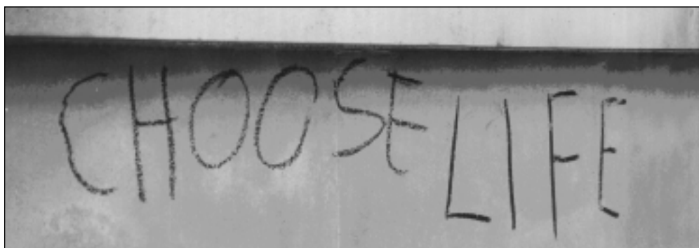
The Ministry of Defence, marked with blessed charcoal, Ash Wednesday 2004

Christi, St Joseph's, Watford Way, Hendon NW4 4TY 020 8203 4884; www.paxchristi.org.uk