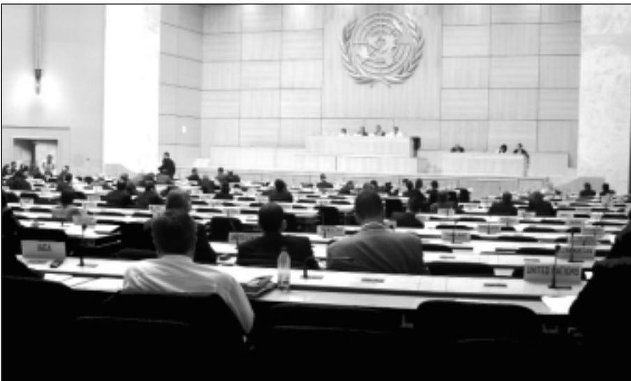
The Preparatory Committee meeting in the main Assembly Hall in Geneva

There were many calls at the conference for those who need to ratify to do so.