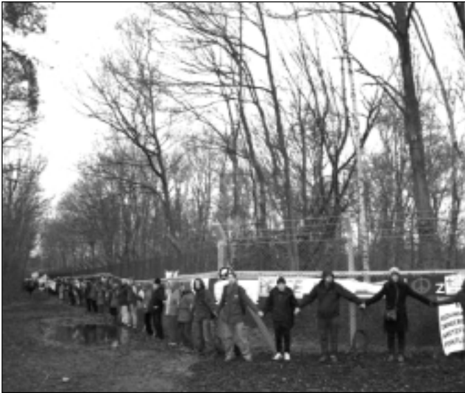
Surrounding the base.