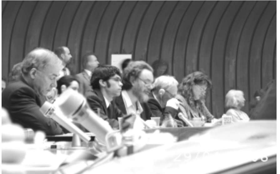
The NGO presentatiions