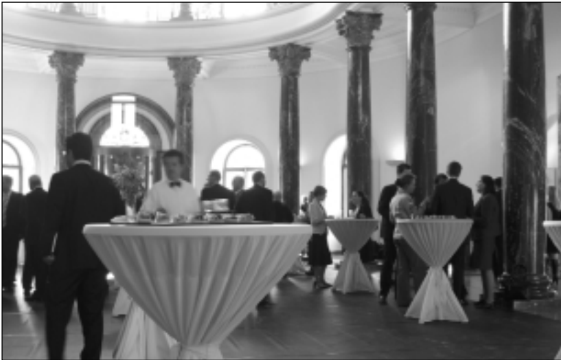
Party hosted by Switzerland Delegation

For NPT Statements, reports, working papers, and documents see: http://www.reachingcriticalwill.org/legal/npt/2008index.html