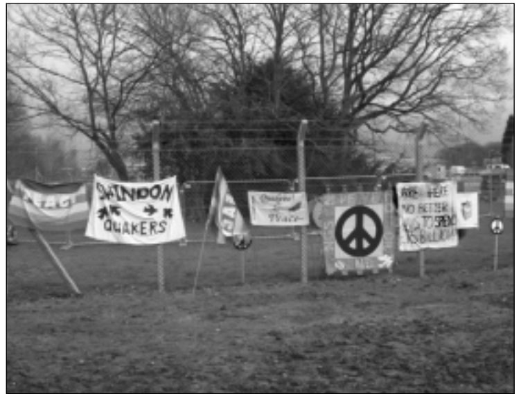
Banners attached to the fence.

Around 5,000 people braved the cold Easter weather to surround the Aldermaston Atomic Weapons Establishment base. The demonstration came on the 50th anniversary of the arrival of the historic first