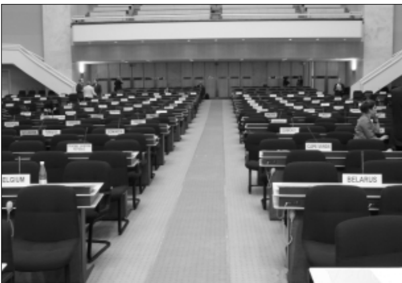
The UN Assembly Hall in Geneva

See also: http://www.acronym.org.uk/npt/index.htm