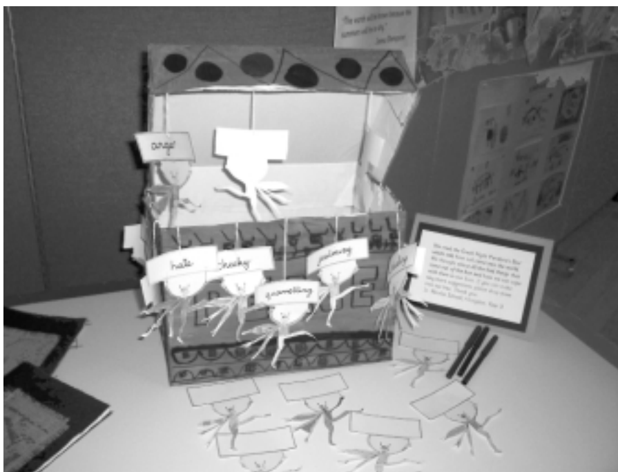
One of the school contributions to the Creation Conference in Oxford, 29 March 2008. Year 3 at St Nicolas School, Abingdon, created this Pandora's Box.