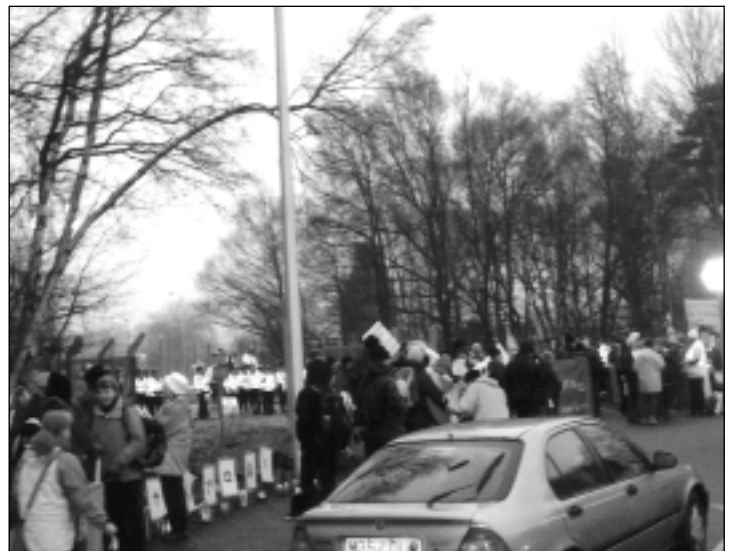
Daybreak at Tadley Gate

The blockade successfully stopped all entry to the base for around half an hour (by police estimate). As one gate was cleared of blockaders, another gate was blocked. People came from all across the UK, and other European countries including Spain and Norway. 26 People were arrested but none from the Faith Gate.