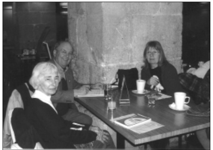
Embassy walkers relax and discuss their experiences in the Crypt Café at St Martins-in-the-Fields