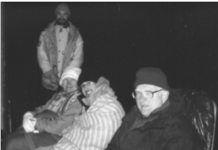
Some of the rather cold vigillers

In October 2008, we held an all-night candlelit vigil, which as well as being meaningful for the participants, had an impact on the media, so it was decided to do this again, but October is October and February is February and as the day approached we felt anxious about the weather and the well-being of the vigillers. The temperature rose however, the air was too still to blow our candles out and a hardy core of 8, augmented by others at the beginning and the end, was able to keep a presence through the night. The liturgy was based on Morning and Night Prayer from Iona together with an hourly repetition of the Prayer for Peace. Simon Cottrell, the Bishop of Reading, took part in our 7.00am prayer.