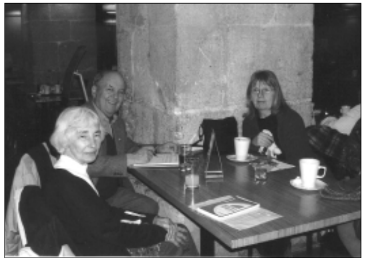
Embassy walkers relax and discuss their experiences in the Crypt Café at St Martins-in-the-Fields