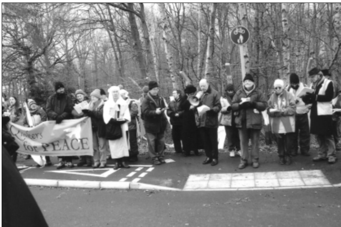
Morning Liturgy at Aldermaston, 15 February 2010