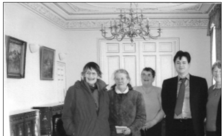
A warm welcome at the Russian Embassy

Iran would be pressing its right to peaceful development of nuclear power. (An unexpected result of this contact was an invitation to an expenses-paid visit to a conference on nuclear issues in Teheran, but for various reasons we felt unable to accept!)