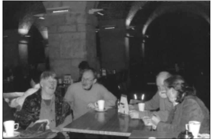
De-briefing in the Crypt Café

There's a useful article on the NPT on the Wikipedia website. Go to http://en.wikipedia.org and search for 'Non-Proliferation Treaty'.