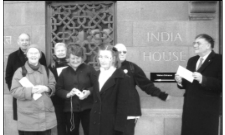
At the Indian High Commission; No entry for CCND but we were met outside

Ireland: to get as much positive commitment as possible to existing agreements, i.e. the 13 steps from 2000 and pressing hard for a nuclear free zone in the Middle East.