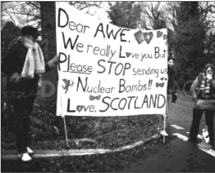
Love from Scotland!

If you're not, don't worry, you're not missing much! It's just a quick and easy way to get messages across but only in 140 characters. Usually used to refer to a website with some important news, but if it's that important we will make sure you, our members, are fully informed via Ploughshare (or email if you've signed up for that). Next stop, a Facebook page!