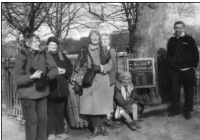
Left: a short comfort break!