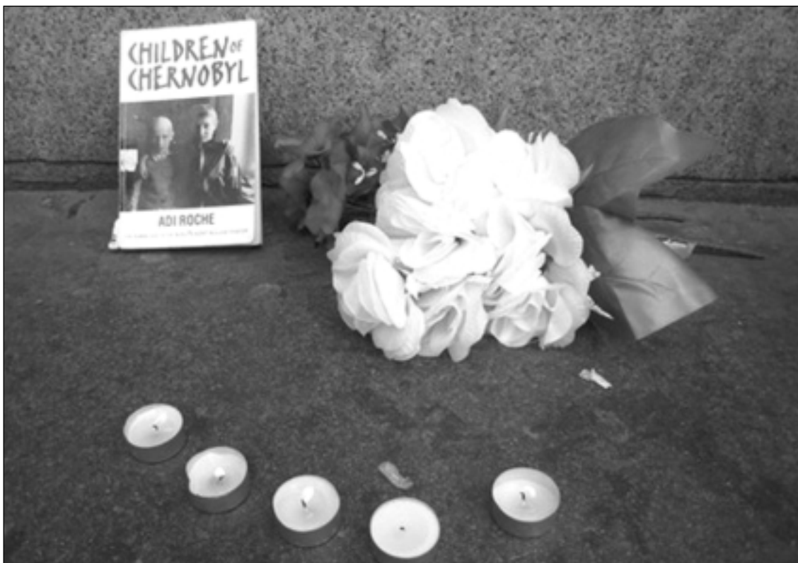
A floral and candle tribute