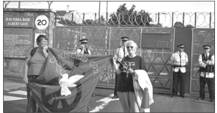
If you don't send us pictures we will have to recycle old ones like this one taken at Devonport in 2004

So if you have any interesting photographs of your events - not too dark please - do send them in (we will scan and return) or email high-resolution photos to christians@cnduk.org Thank you!