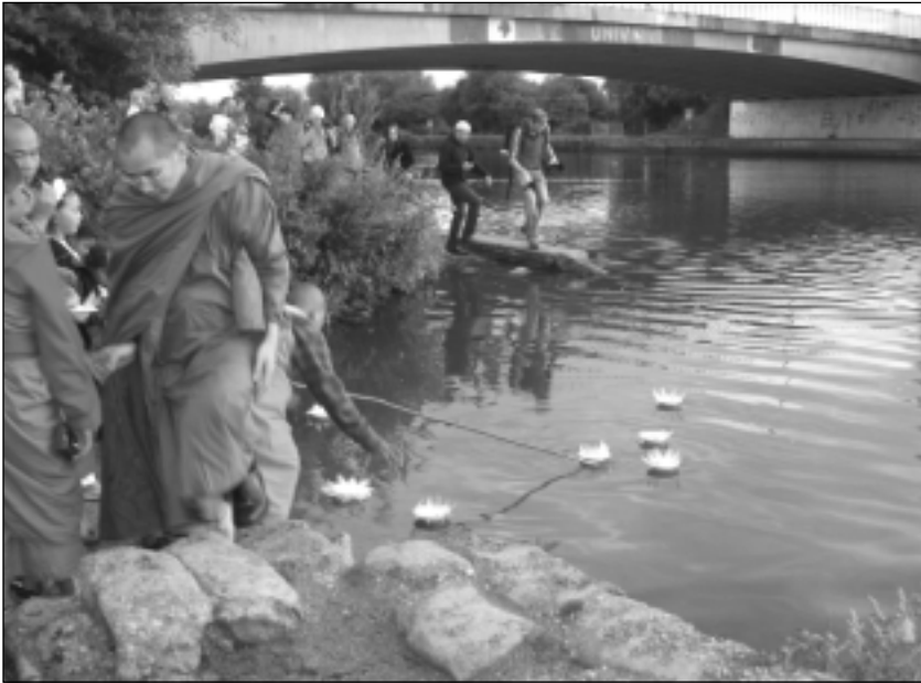
Buddhists join the lantern floating at Donington Bridge in Oxford on Nagasaki Day