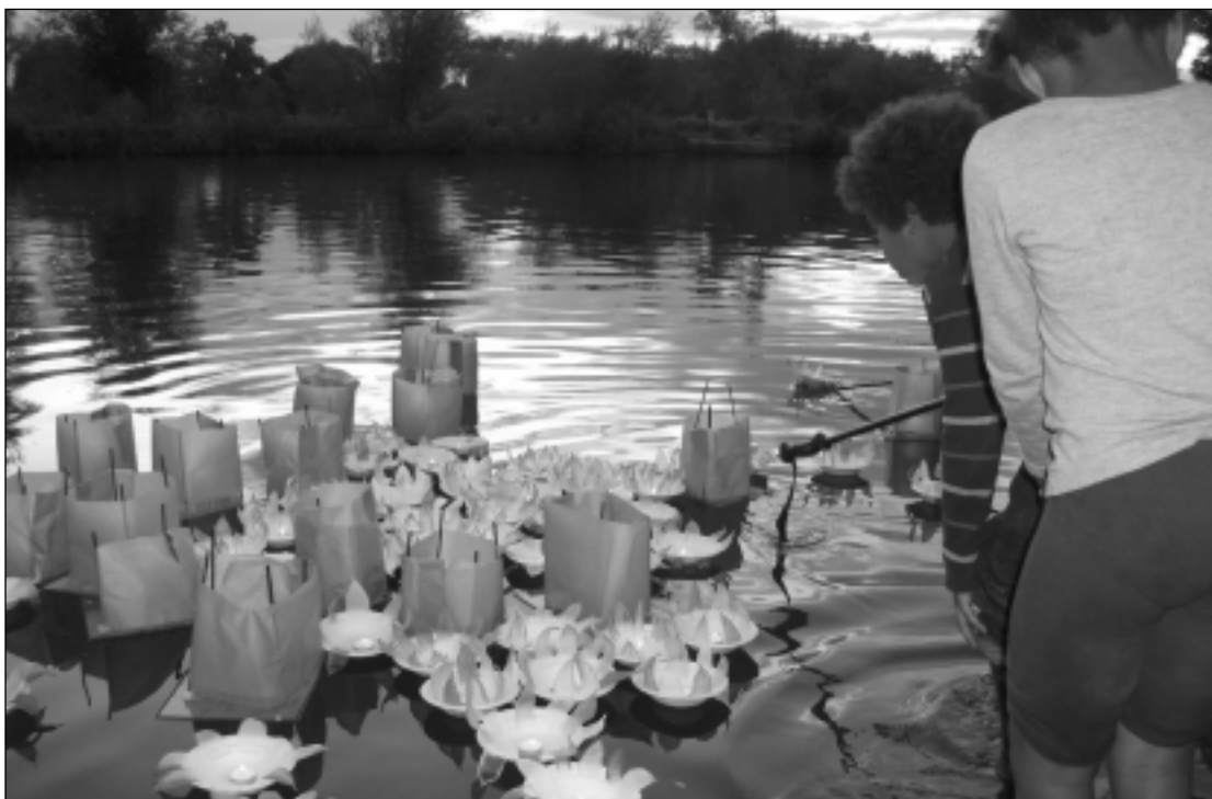
Left: Floating lanterns in Oxford on Nagasaki Day