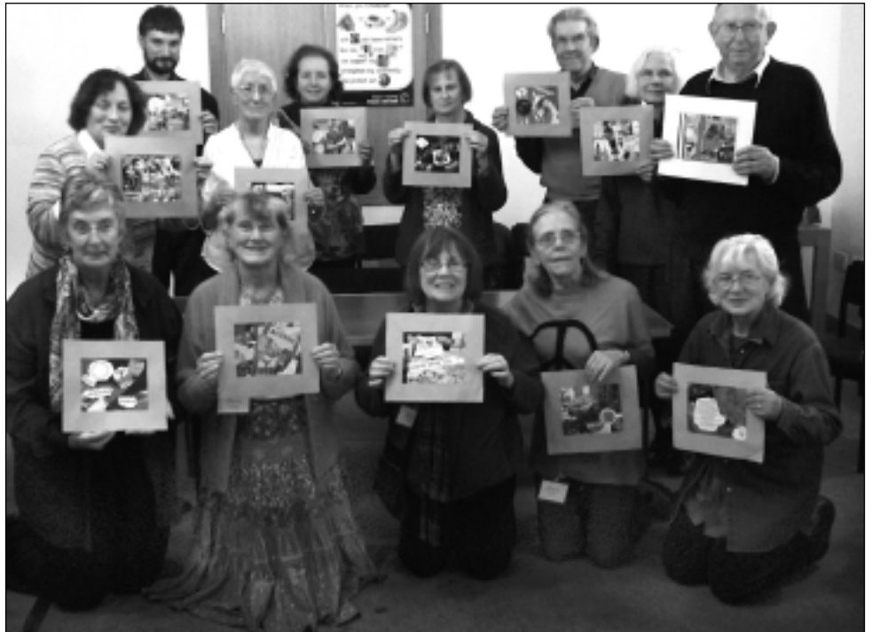
Some collages done in a workshop at Pilgrimage to Peace

In the "Fall" the "eating of the fruit" was the irresponsible/selfish use of creation. Peace is the