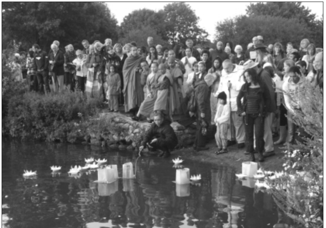
More floating lanterns on Nagasaki Day in Oxford

We also have a new elist for CCND members and friends. You can join the elist by emailing: christiancnd-subscribe@yahoo.com Then you can post a message using: christiancnd@yahoo.com