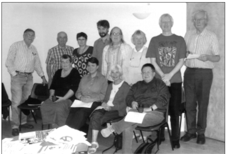
CCND members and Exec gather for our AGM on 24 September