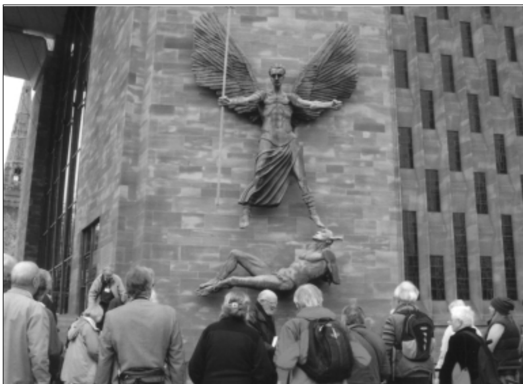
The Epstein sculpture outside Coventry Cathedral

Later, when the Emperor Constantine made Christianity the official religion of Rome, pacifism was largely abandoned for Holy War, but many held to the way of Peace. This inspired the Church Fathers to institute the Just War Doctrine intended to prevent the worst excesses of war. Sadly it has not been very effective in time of war but has inspired peace initiatives such as the United Nations Organisation and is a powerful argument against nuclear war, which endangers the sacred gift of life on our planet.