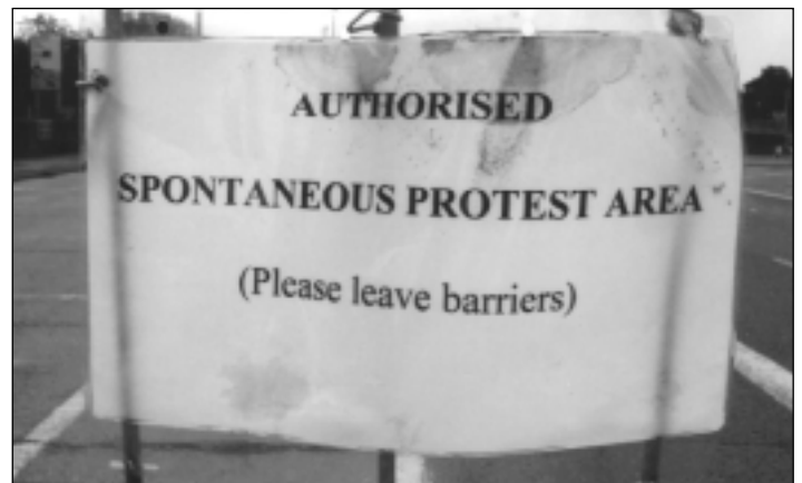
MoD police 'authorised' a previous protest at Aldermaston as you can see

Please specify which day of the week you prefer, and which weeks you would be available to cover.