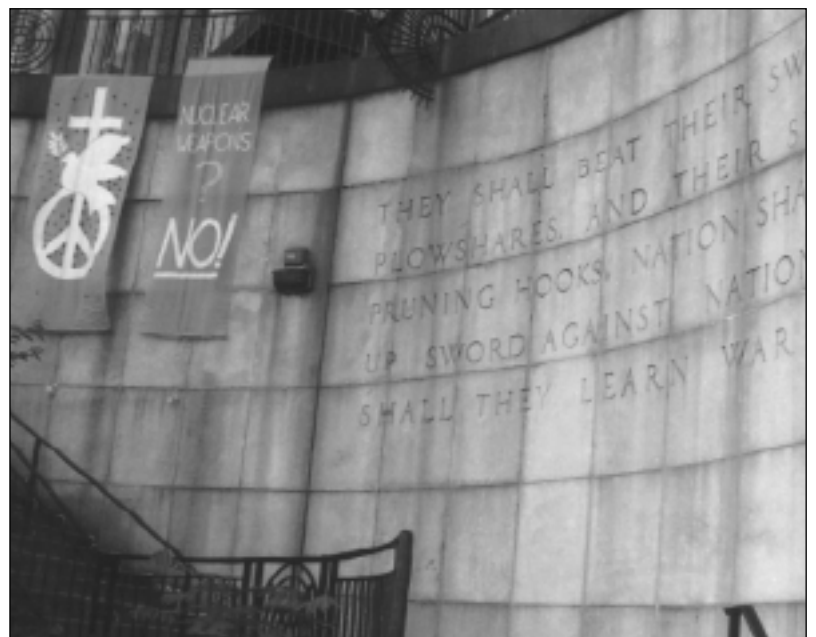
CCND banners at the Isaiah Wall opposite the UN in New York

There was no major event at Aldermaston for Easter planned this year, so a small group from CCND went along anyway and planted some flowers and had a short prayer vigil.