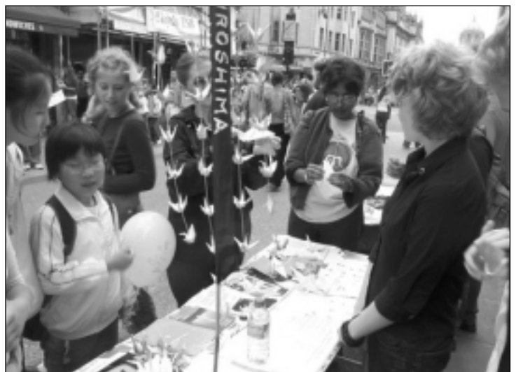
Making paper cranes in Oxford.